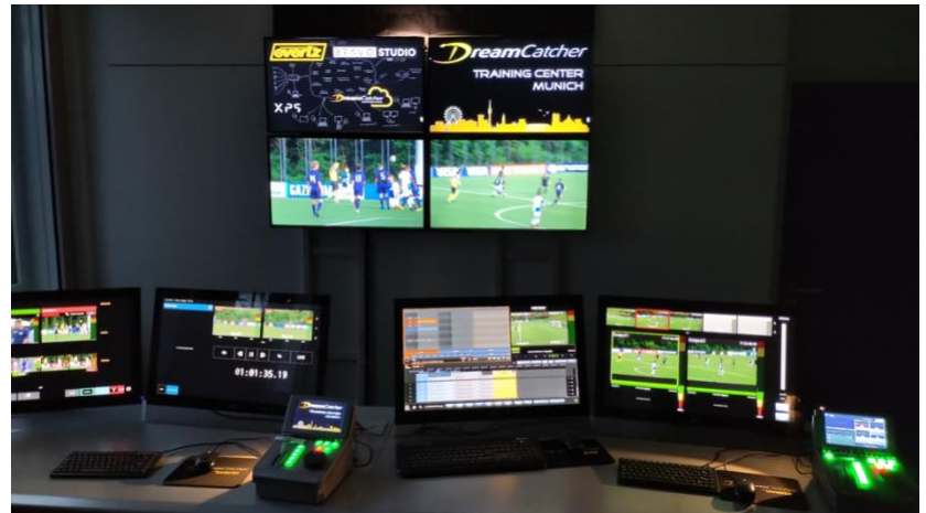
DreamCatcher™ Training Center Munich is a new resource for professional broadcast operators to expand their knowledge of the award-winning DreamCatcher™ live production platform.